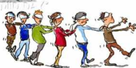
"I'm just doing what the other ones are doing"